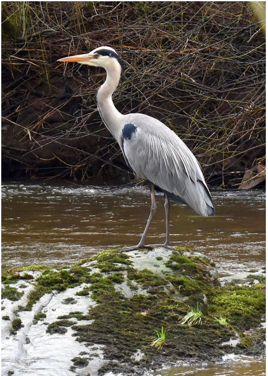
Heron at Burrs -playing the waiting game!