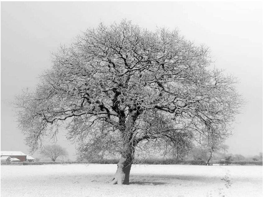
Sudden January white-out!