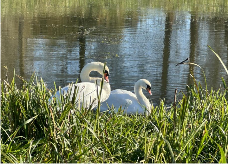
Serene swans and autumn leaves